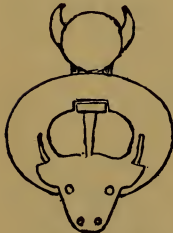
Head War Chief.

The Head Chief wears, in addition to the beard, a horned shield. On the circle of the shield is engraved the totem of the Tribe.